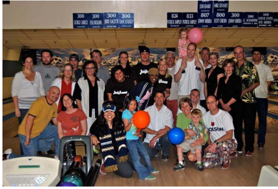
Employees at The Art Institute of California-San Diego Gather for a Group Photo at their Bowl-a-Rama for Scholarships